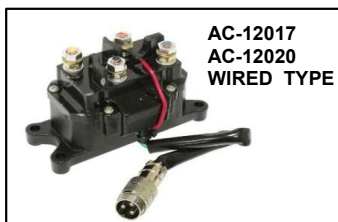
AC-12017 AC-12020 WIRED TYPE