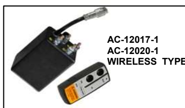
AC-12017-1 AC-12020-1 WIRELESS TYPE