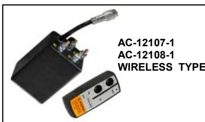
AC-12107-1 AC-12108-1 WIRELESS TYPE