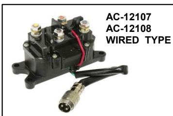
AC-12107 AC-12108 WIRED TYPE