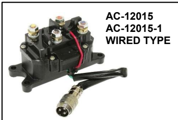
AC-12015 AC-12015-1 WIRED TYPE