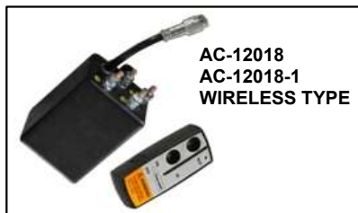
AC-12018 AC-12018-1 WIRELESS TYPE